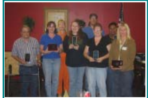
Policy Council members display the awards they received during the September meeting.

See Page 2 for a complete list of all Policy Council members who received an award.