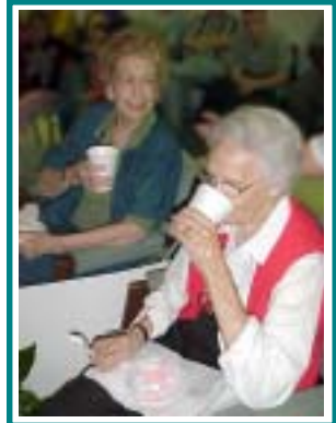
Foster Grandparents share a light moment on National Grandparents Day.

Audubon Area Community Services celebrated seniors at two events recently. On National Grandparents Day, September 10th, the children and staff at the RiverValley Behavioral Health Hospital in Owensboro honored volunteers with AACCS’ Foster Grandparent Program.