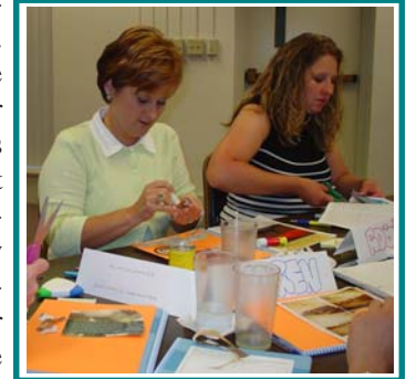
Participants learning about the Healthy Marriage Initiative create pictorial representations of a marriage mission statement.

Members of the Owensboro Coalition for Strengthening Families hope to get this word out to families and individuals in their community who are thinking of entering a relationship or simply want to increase their chances of having a stable relationship one day.